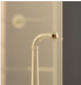
Fitting for Hardware on Glass Doors