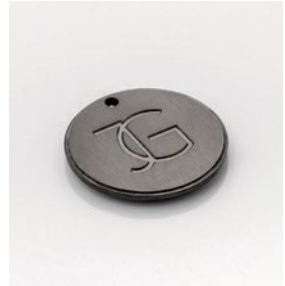
DBZW: Dark Bronze Waxed Finish: Living