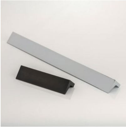
Esprit Cabinet Handle

Nowadays, we reference minimalism in the 'less is more' philosophy. In fact, this phrase was adopted by architect Ludwig Mies van der Rohe in the 1950s to describe his aesthetic. Rohe's approach of extreme simplicity has inspired many designs, including one of our cabinet handle collections, which is named accordingly.