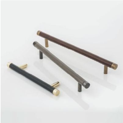
Thurloe Cabinet Handle Wrapped in hand-stitched bridle leather.

From the clean, interesting texture of the linear knurl, to the Ashworth handle, which pays homage to the Bauhaus movement, here are the top picks from our collection of contemporary cabinet hardware.