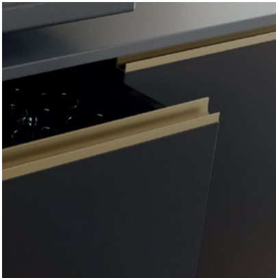
Alesca Edge Pull