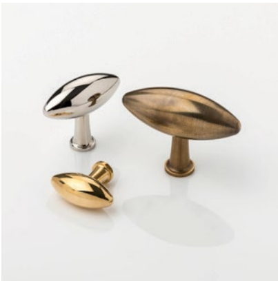
Dawson Cabinet Pull The very essence of classical contemporary design.