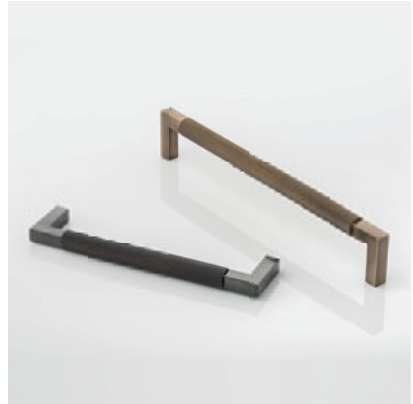
Ashworth Diamond Knurl Handle Paying homage to the Bauhaus movement, with the addition of a diamond knurl.