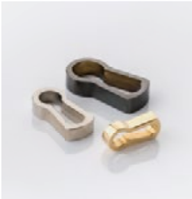
Shadow Keyhole Profile Escutcheon