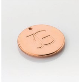
BCO: Brushed Copper Finish: Plated