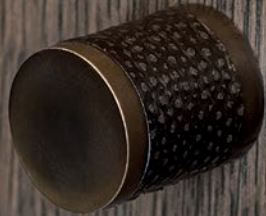
Thurloe Cabinet Pull in Mid Antique Brass with Shagreen Leather (CP1003).