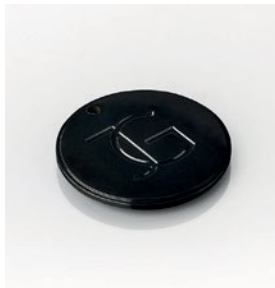
PMB: Polished Midnight Black Finish: Plated