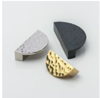
Hammered Cabinet Handle CH1082 Each piece is lovingly made, with no two the same.