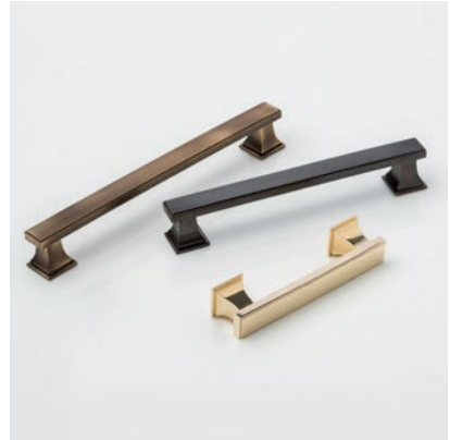
Arlington Cabinet Handle CH1062 Reflecting the style and luxury that marked the era.