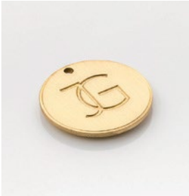
BBW: Brushed Brass Waxed Finish: Living

Hand-finished using traditional methods that have been passed down through generations, our signature metal finishes are available across all our solid brass products.