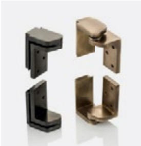
Adjustable K-Pivot PV1020

Ensuring that even the smallest details are considered, enabling a perfect match between the joinery fittings and main hardware of the space.