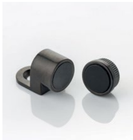
Magnetic Catch with Leather Pad