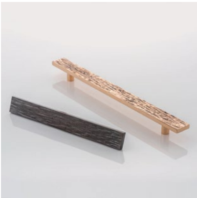
Molten Texture Cabinet Handle CH1032 Imitating molten, for a rippled and rugged texture.