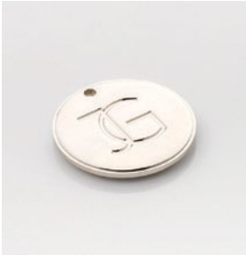
PN: Polished Nickel Finish: Plated