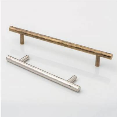
Rolled & Hammered Cabinet Handle CH1012 Crafted by artisans using traditional blacksmith methods.

It is in this theme that we have designed some of our most beautiful textured cabinet hardware: From the rugged Organo cabinet pull to the soft sand-like undulations of the Harlyn cabinet handle.