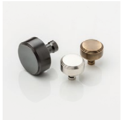
Bartlett Cabinet Pull Harnessing the beauty of concentric circles.