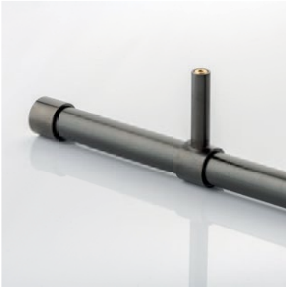
Round Modern Hanging Rail HR1004 End Bracket HR1006 Support Bracket HR1008

From the simple belief that the inside of the wardrobe should look as good as the outside, with matching finishes from the dressing room door to the back of the wardrobe.