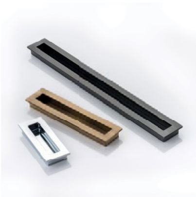
Recessed Pull Perfect for sliding cabinet or wardrobe doors.