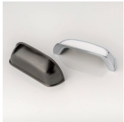
Buxton Cabinet Handle CH1106 A nod to Georgian period architecture.