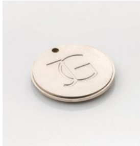
BN: Brushed Nickel Finish: Plated