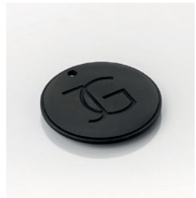
BMB: Brushed Midnight Black Finish: Plated