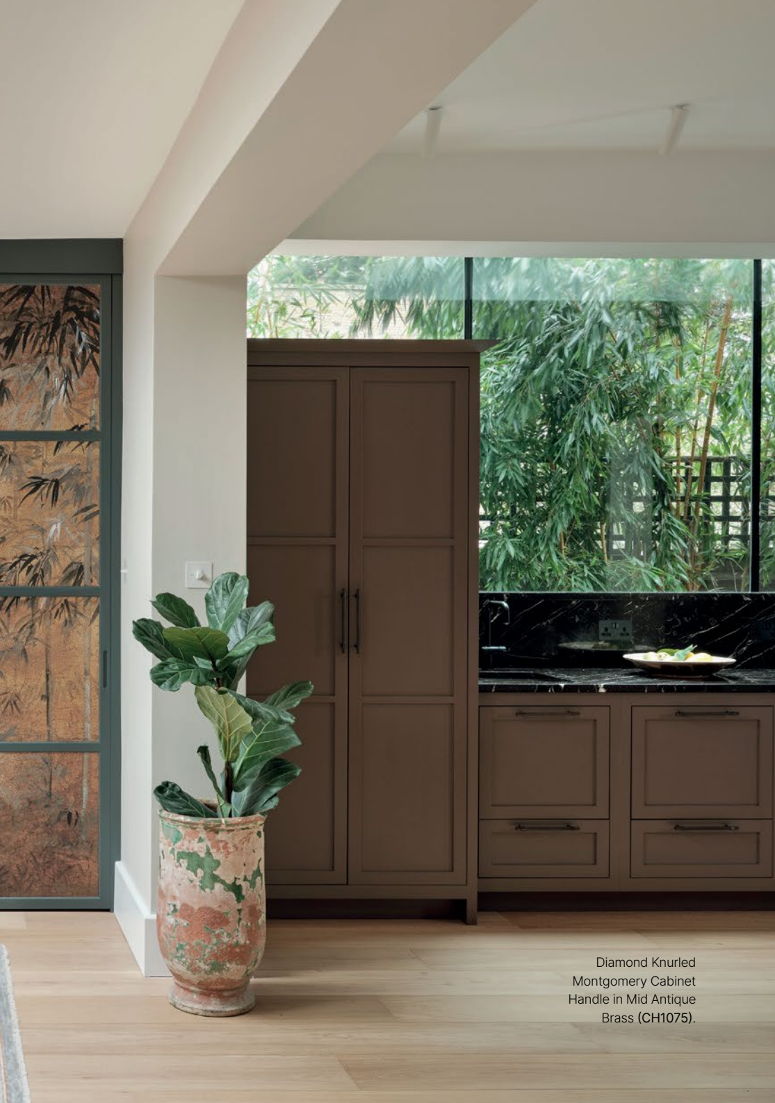
Diamond Knurled Montgomery Cabinet Handle in Mid Antique Brass (CH1075).