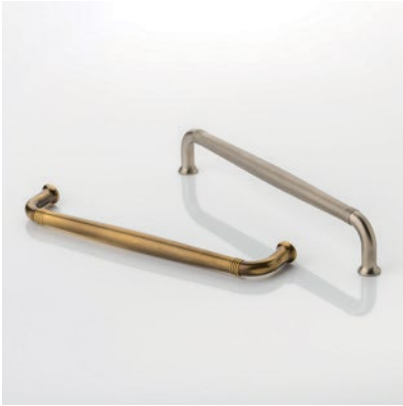
Hurleigh Cabinet Handle Featuring soft curves with ringed detailing.

This collection of cabinet hardware has been inspired by several historical periods, with particular focus on the Georgian period, and the early 20th century. We've focused on symmetry and detailing, and used art, architecture and the design principles that mark classical design to form our design process.