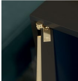
Pivot Hinge Set PV1016