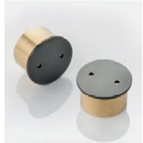
Flanged Recessed Silent Catch