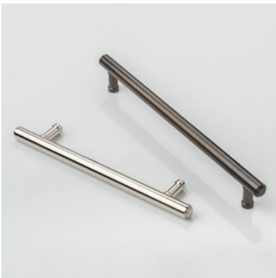
Bartlett Cabinet Handle CH1071 Matching perfectly with the Bartlett pull.