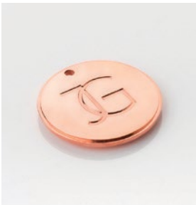
PCO: Polished Copper Finish: Plated