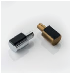
Cylindrical Shelf Support with Leather Pad FA1001