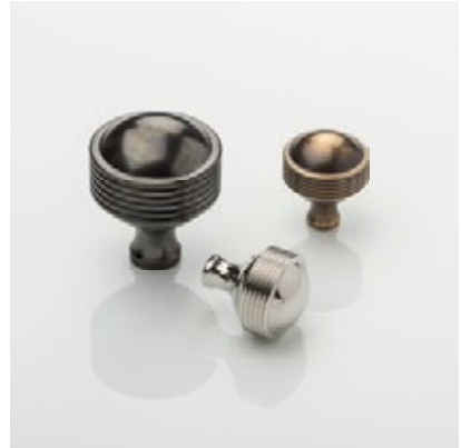
Hurleigh Cabinet Pull CP1005 Creating a matching set with the Hurleigh handle.