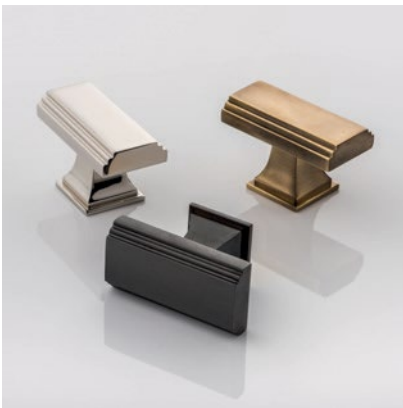
Dewhurst III Cabinet Pull CP1132 Fusing the Arlington leg with the body of one of our most popular designs: the Dewhurst.