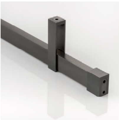
Rectangular Hanging Rail HR1001 End Bracket HR1002 Support Bracket HR1003