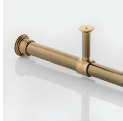
Round Classic Hanging Rail HR1004 End Bracket HR1005 Support Bracket HR1007