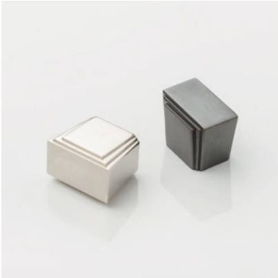
Thomson II Cabinet Pull CP1077 The epitome of door jewellery, where the line detail fans out gently.