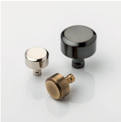
Archibald Cabinet Pull Designed with Bauhaus principles in mind.