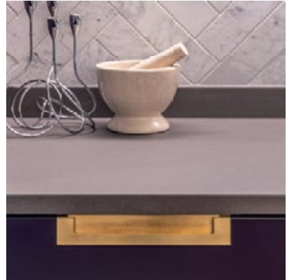
Rohe Integrated Cabinet Handle Inspired by Mies van der Rohe, the father of minimalism.