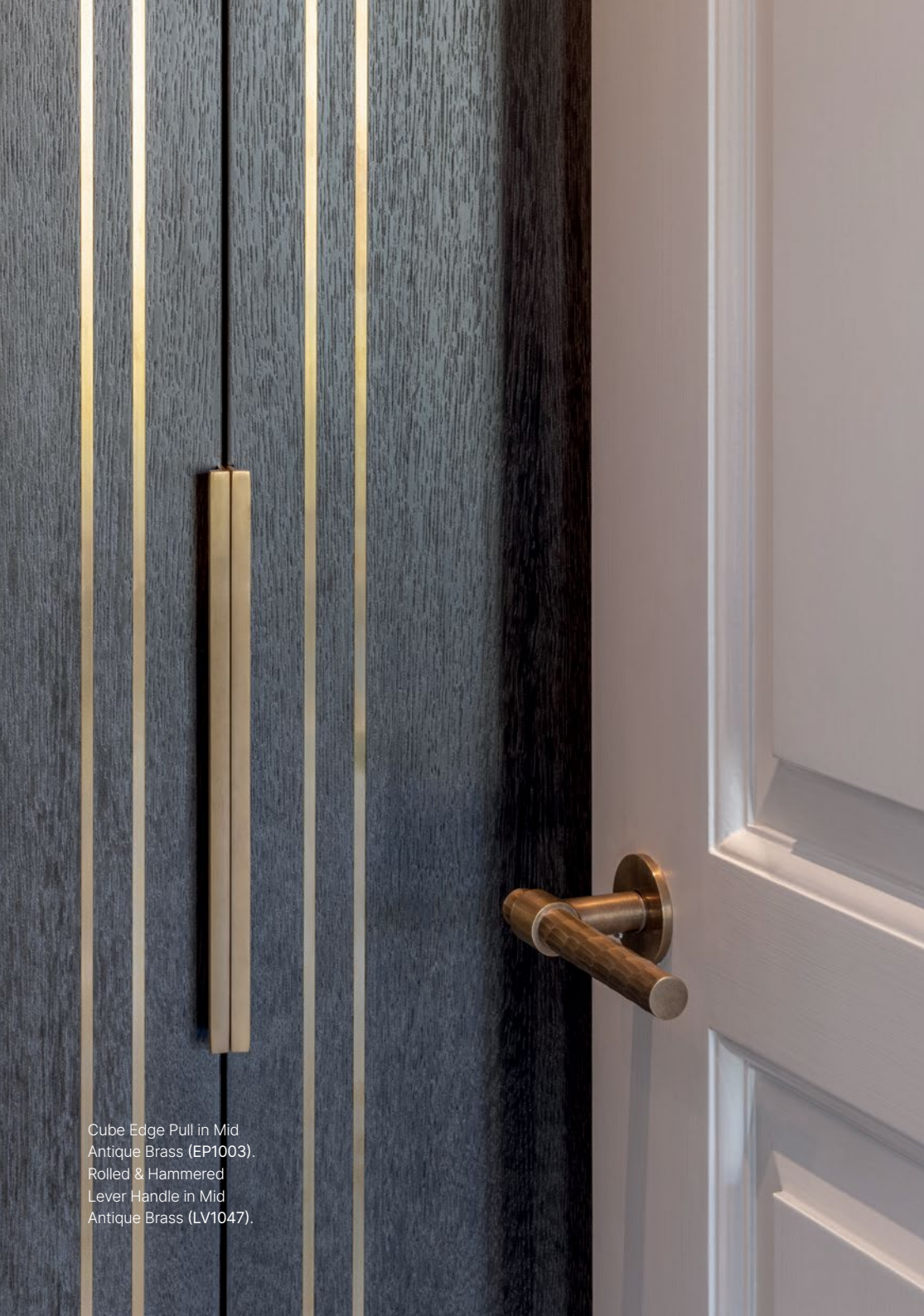
Cube Edge Pull in Mid Antique Brass (EP1003). Rolled & Hammered Lever Handle in Mid Antique Brass (LV1047).