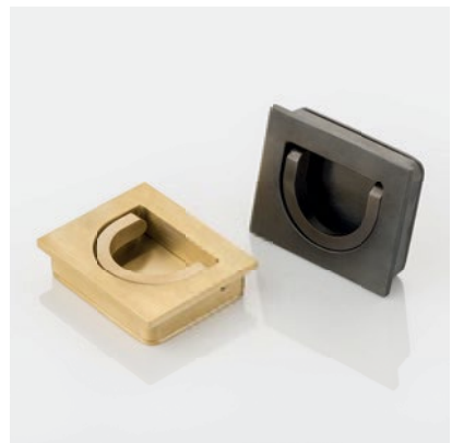
Falmouth Recessed Pull With no visible fixings for a flawless finish.