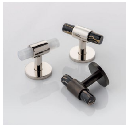
CZ Cabinet Handle CP1105 Putting the spotlight on marble: a beautiful but delicate material to shape.