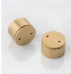
Recessed Silent Magnetic Catch