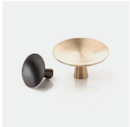
Jude Cabinet Pull

Integrated into the door for a handleless finish.