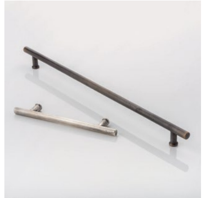
Organo Cabinet Handle CH1027 Made from real bronze using traditional casting methods.