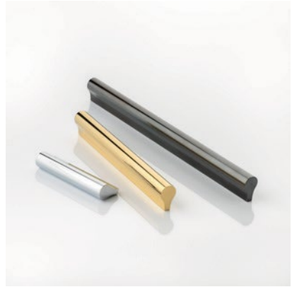
Fonteyn Cabinet Handle

Playing on the angular aesthetic of the Lotus Esprit.