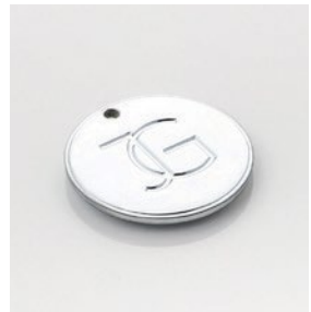
PC: Polished Chrome Finish: Plated