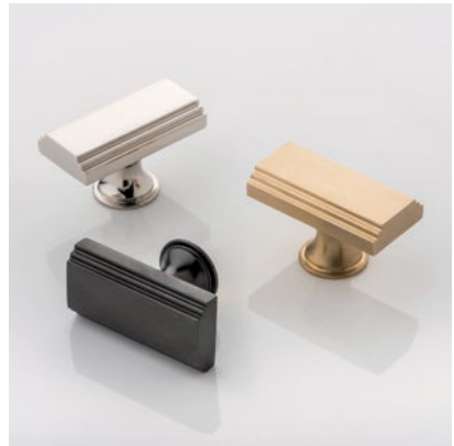
Dewhurst II Cabinet Pull CP1131 A striking pull with texture and interest created by the stepped detail.