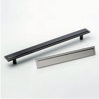
Harrison Cabinet Handle CH1059 With a rounded back for a more comfortable grip.

With this inspired collection of cabinet hardware, we're proud to revive an element of the coveted Art Deco style: From the Harrison marking our first foray into a contemporary Deco style, combining straight lines with subtle Art Deco detailing, to the Dewhurst, where the cascading effect, created by the stepped detail, is our interpretation of the layered shapes that characterised this period of design.