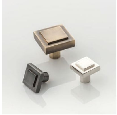
Harrison Cabinet Pull CP1101 Combining straight lines with subtle Art Deco detailing.