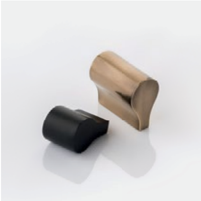
Fonteyn Cabinet Pull Mirroring the distinctive form of the Fonteyn handle.