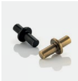
Radi Shelf Support FA1004