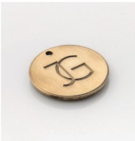
MABW: Mid Antique Brass Waxed Finish: Living