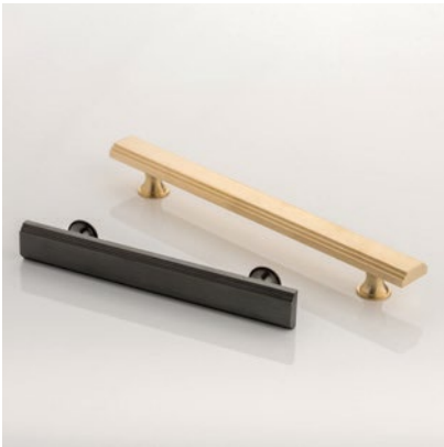
Dewhurst II Cabinet Handle CH1098 An interpretation of the layered shapes that characterised this period of design.