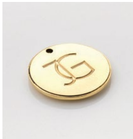
PBW: Polished Brass Waxed Finish: Living