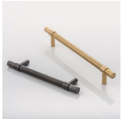
Montgomery Cabinet Handle For a simple and solid grip.