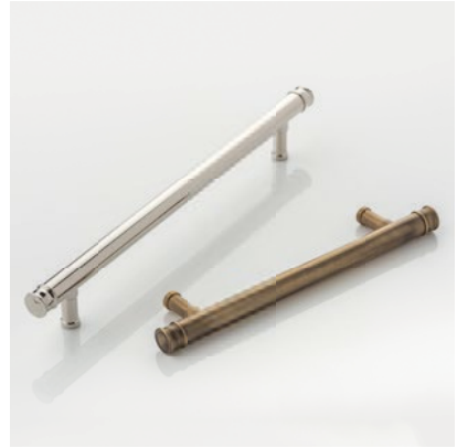
Huntingford Cabinet Handle Polished, presentable, and classic: a beautiful accessory.