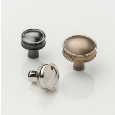
Huntingford Cabinet Pull CP1104 Designed to match the Huntingford cabinet handle.