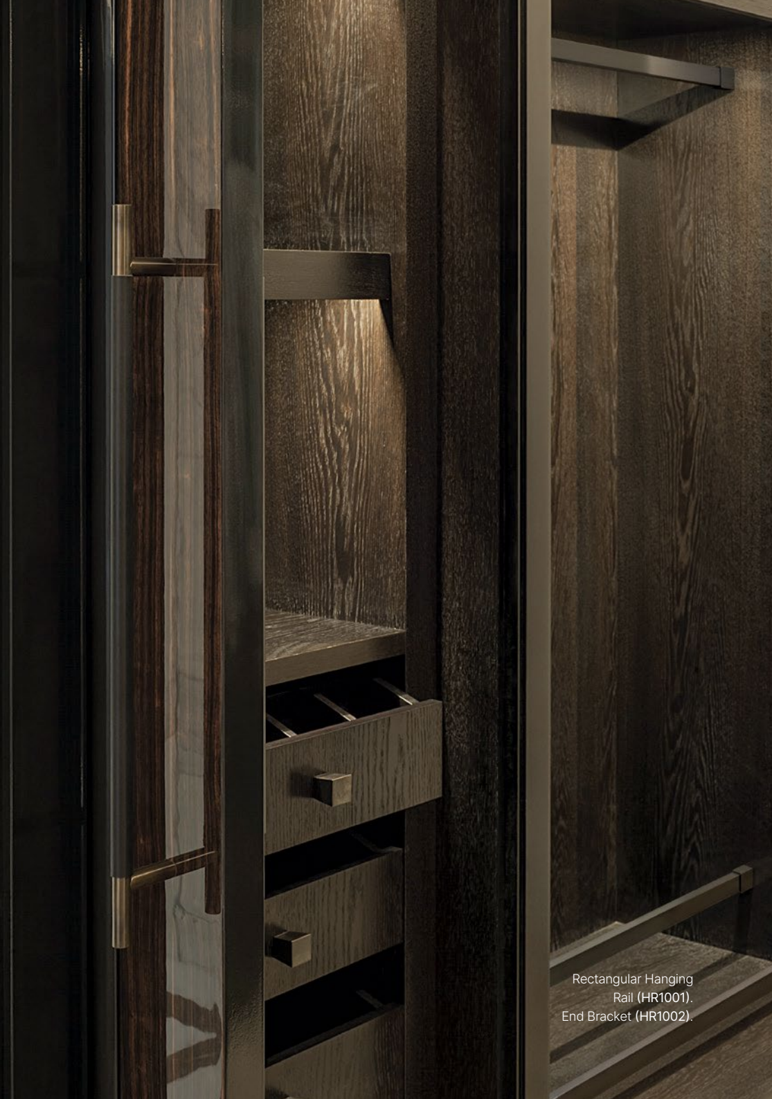
Rectangular Hanging Rail (HR1001). End Bracket (HR1002).