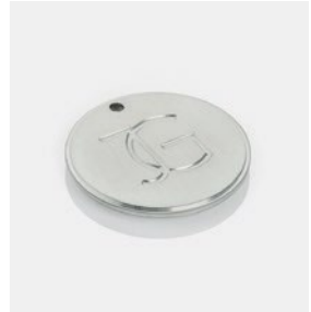
BC: Brushed Chrome Finish: Plated