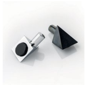
Switch Shelf Support with Leather Pad FA1002