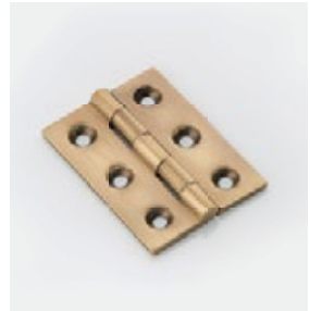
Solid Brass Hinge for Cabinetry HG1050