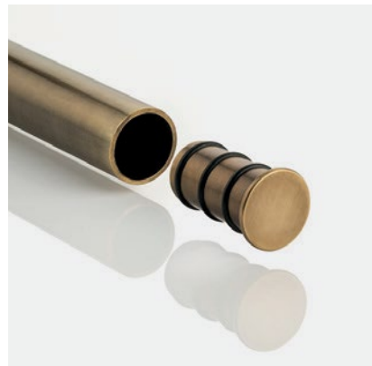
Round Hanging Rail End Cap HR1012